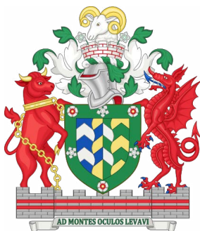
Arms of the Former Cumbria Council

When the administrations of Cumberland, Westmorland, the Furness portion of Lancashire and the Yorkshire town of Sedburgh were amalgamated the new council used the Cumbria name. It also received a new coat and banner of arms, which used some symbols from its component areas that will be familiar from their registered county flags – grass of Parnassus for Cumberland, red rose for Lancashire and white rose for Yorkshire - as well as a zig-zag pattern unique to Cumbria.