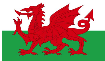
Flag of Wales