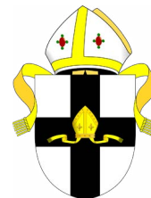
Arms of Carlisle Diocese